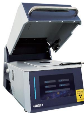
XRF Plating Thickness Instruments