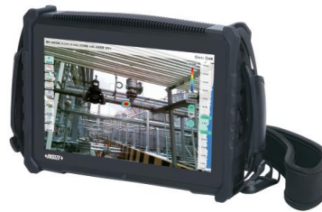
Industrial Acoustic Imagers