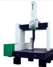
Coordinate Measuring Machines