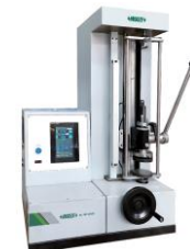
Manual Spring Testing Machines