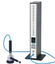
Air Gauge And Displays