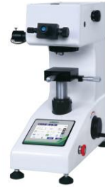
Vickers Hardness Testers