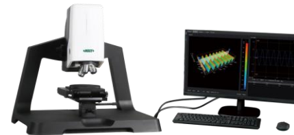
White Light Interference Measuring Microscopes