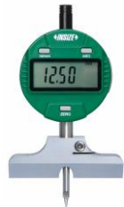
Digital Depth Gauges