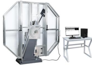
Impact Testing Machines