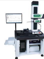
Surface Profile Measuring Machines