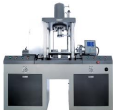
Vertical Bending Testing Machines