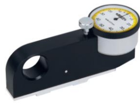
Buttress Thread Tooth Thickness Gauges