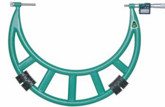
Digital Outside Micrometers