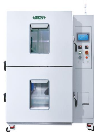
Thermal Shock Test Chambers