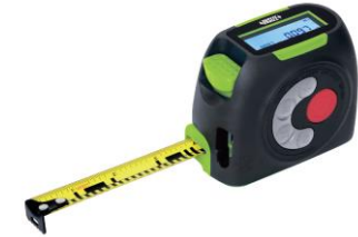
Wireless Digital Measuring Tapes + Laser Distance Meters