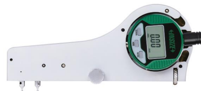
Digital Thread Pitch Measuring Instruments