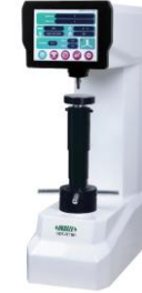
Rockwell Hardness Testers