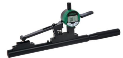
Digital Thread Height Measuring Instruments