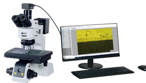
Coating/Film Thickness Measurement Systems