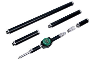
Carbon Fiber Bore Gauges