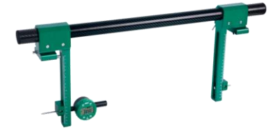
Carbon Fiber Comparison Gauges